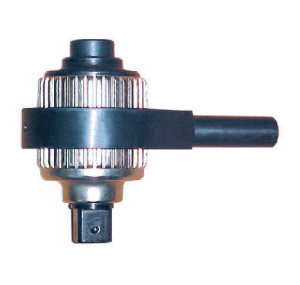
STM - 1