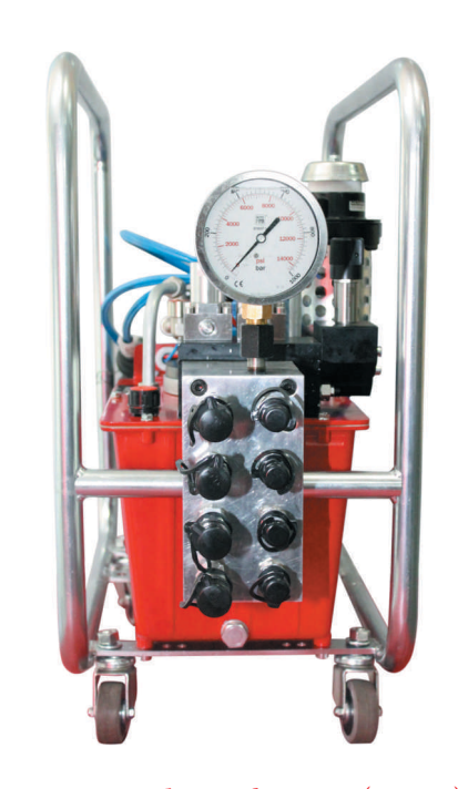
AP1000 with Quadra Port (4 Port)