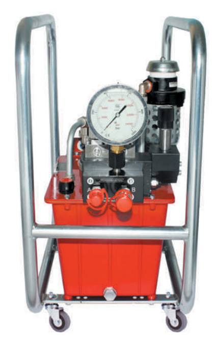
AP1000 with Mono Port