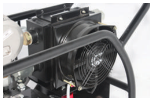
Air oil cooler for higher degree of oil cooling.