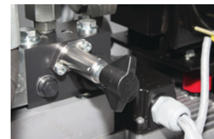
Highly precise pressure setting valves.