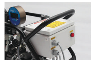
Enclosed fully solid state electronics.