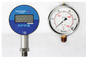
Digital or Analog pressure gauges